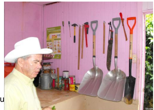
Before and after pictures of one of Coopellanobonito's farmer's warehouse