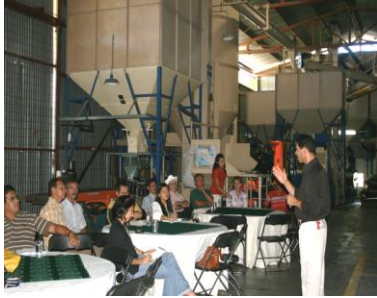
Workshop with COOCAFE co-ops to relate Coopellanobonito's progress