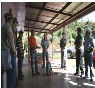
Producers during a two-day workshop administered by ILO-certified technician

The coop presents many of the challenging characteristics found in other COOCAFE cooperatives. Its farms are distributed along a mountainous 10-kilometer radius and its drop-off points inhibit communication with producers. The coop is located in the region of Los Santos, an area that receives 11,000 migrant workers from Panama and Nicaragua every year. Coopellanobonito producers hire this migrant labor force during the harvest season. Like other COOCAFE coops, Llanobonito will soon undergo audits for certifications. At present, the coop is Fair Trade and C.A.F.E. Practices certified.